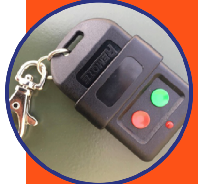
Wired & Wireless Remote Switches